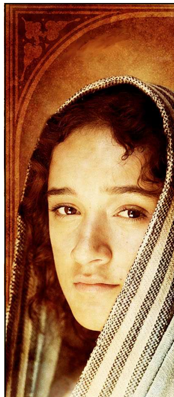
THE NATIVITY STORY The Heart of Mary

CCLI License #16309 CVLI License #50009620